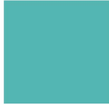
PMS 7472 C=63 M=7 Y=33 K=0 R=88 G=183 B=179 Hex #58b7b3