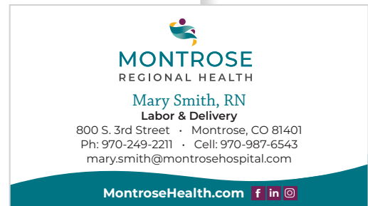
Business Card - Front