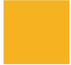
PMS 7409 C=3 M=33 Y=100 K=0 R=245 G=177 B=30 Hex #f5b11e