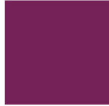
PMS 7650 C=51 M=98 Y=38 K=23 R=117 G=32 B=87 Hex #752057